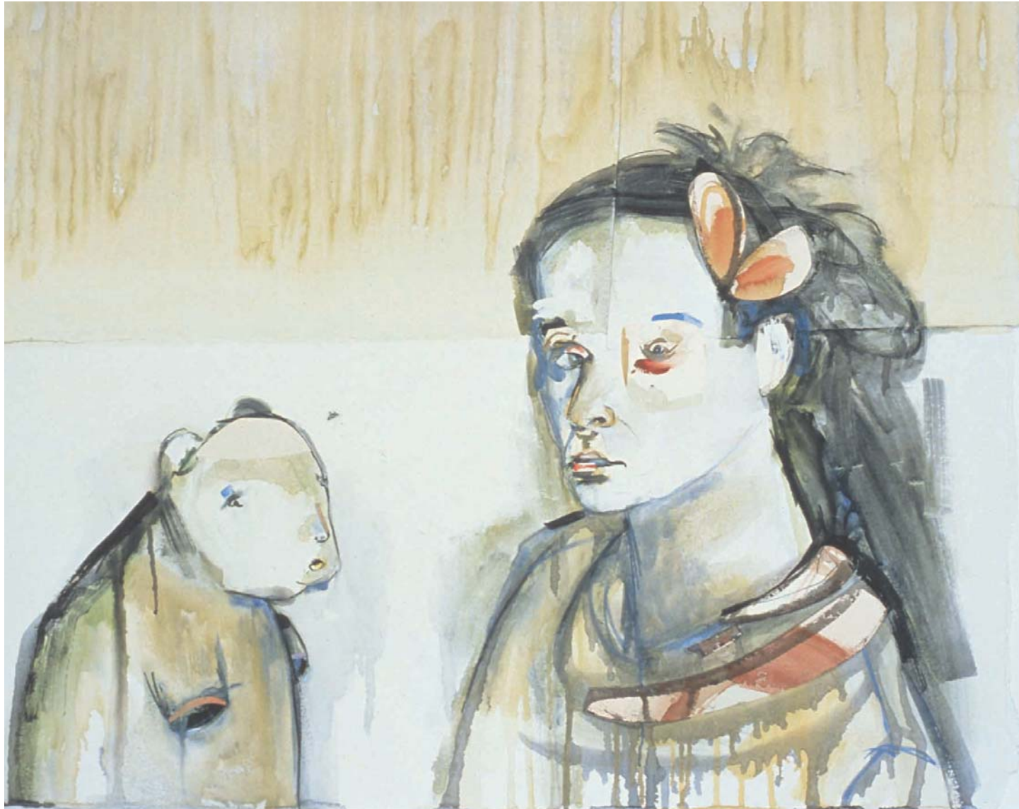
Self Portrait with Armless Dog 37.75" x 46" watercolor, collage on paper 2003