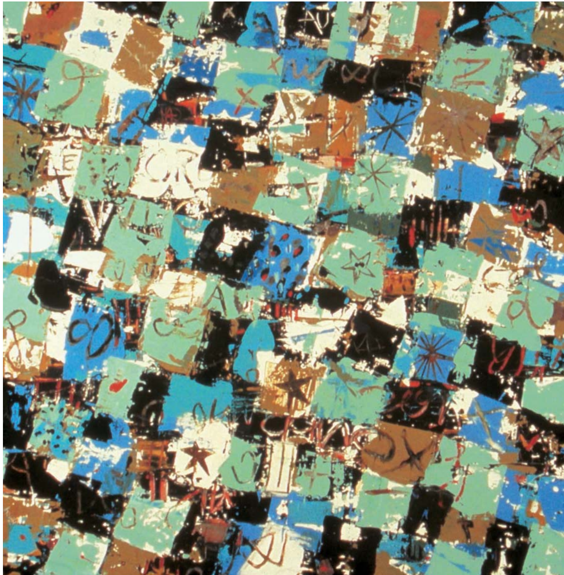
Script or Lead 52" x 52" acrylic and metal leaf on canvas 2004