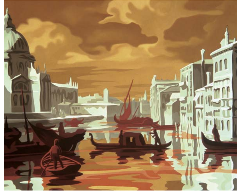
Venice 43" x 52" oil on linen 2003

Park lives and works in Seattle and is represented locally by Howard House.