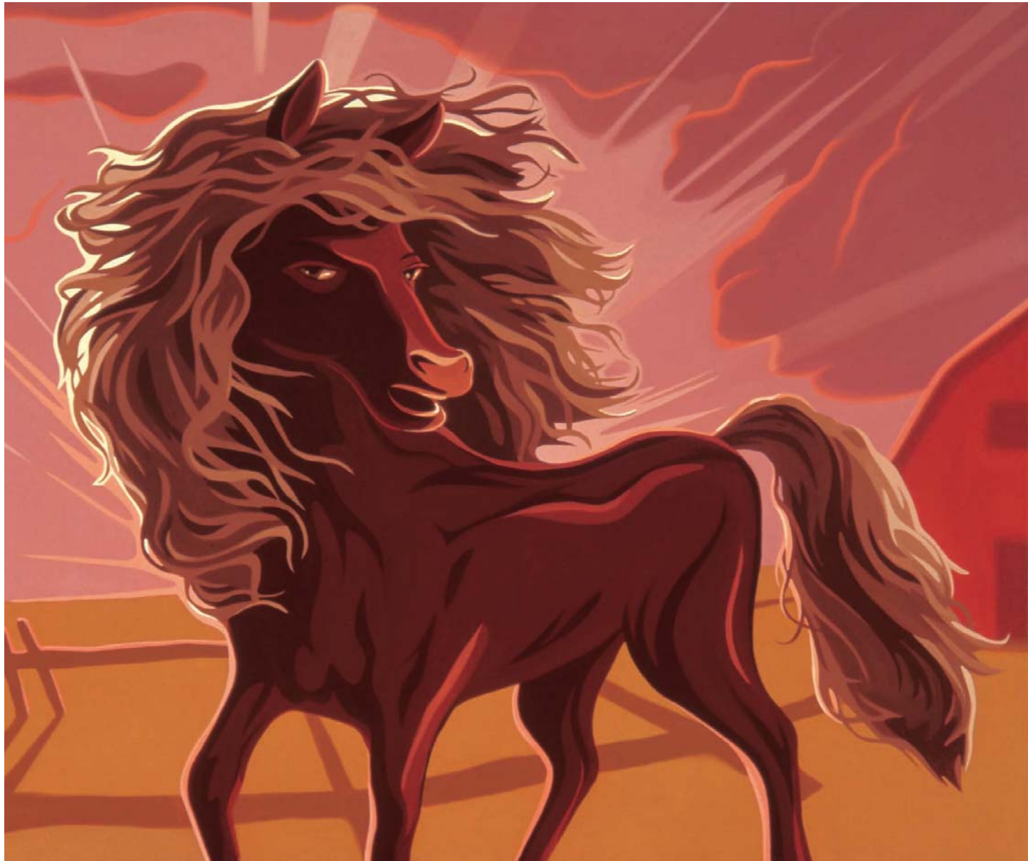
Honorific 20" x 24" oil on linen 2003