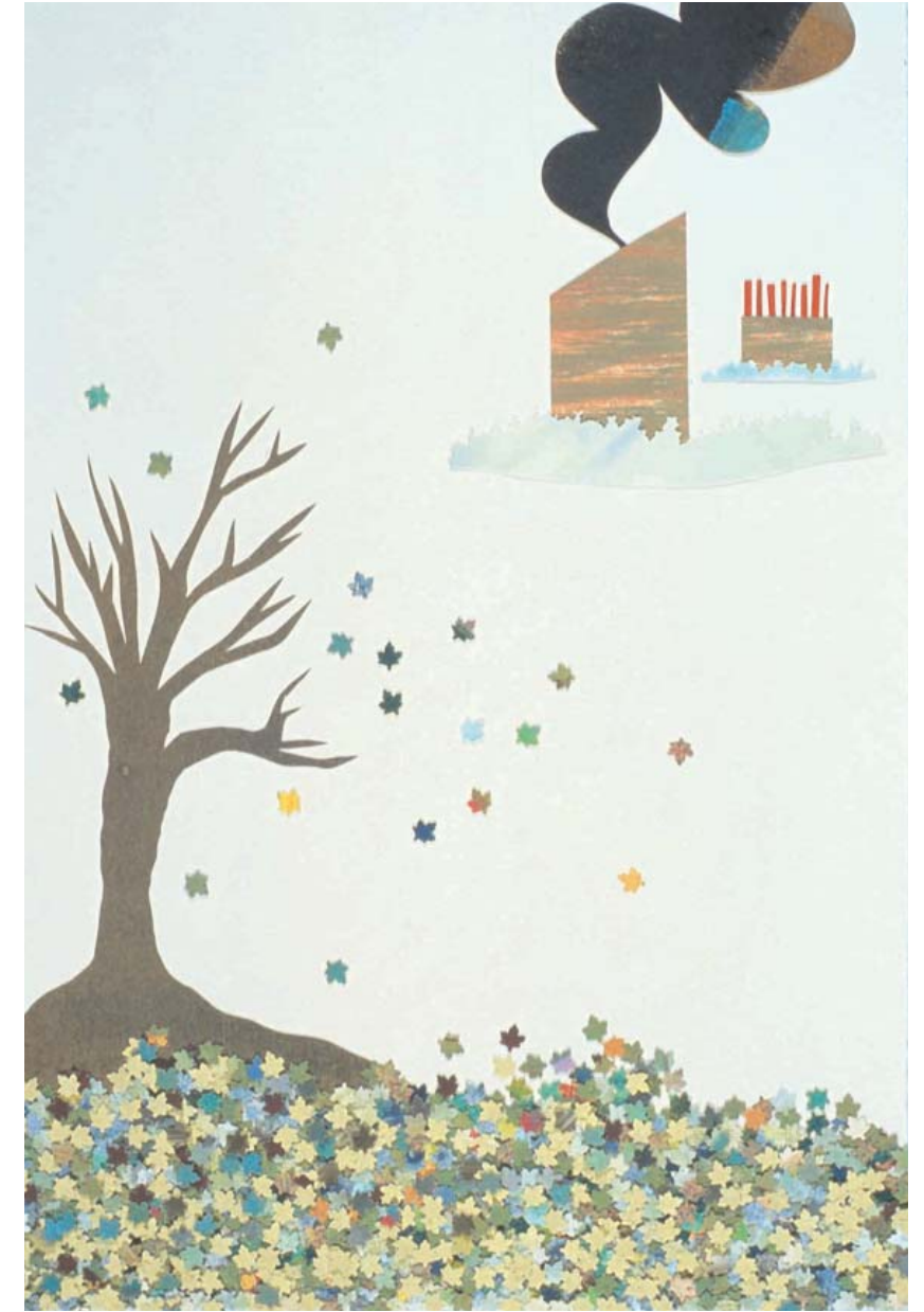
The Tree 13" x 9.5" collage, watercolor, woodcut 2004

Cowie lives and works in Seattle, and is represented locally by the James Harris Gallery.