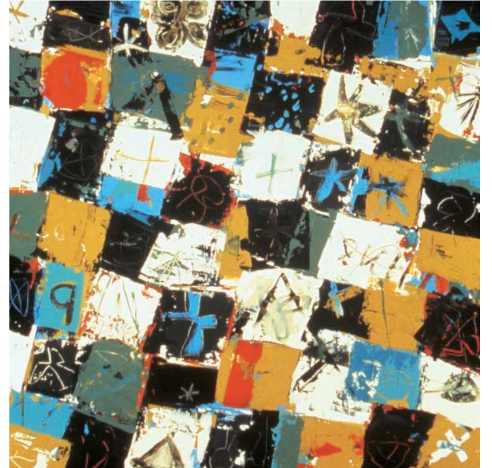
Fly or Nine 36" x 36" acrylic and metal leaf on canvas 2004