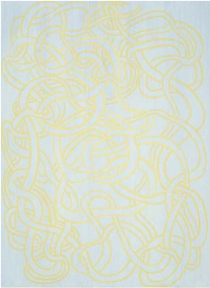
Litmus 30" X 22" acrylic on paper 2004