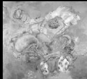
Untitled (20.09) / 2000 / Oil on canvas

The works explode in places and implode in others. Casis creates surfaces that are as alive as her subject, and backgrounds that refuse to sit still and be backgrounds."