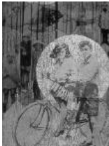
Hope & Survival / 2001 / Mixed print media

"Being the daughter of an Armenian genocide survivor, I have an unwavering awareness of the violence and bloodshed taking place worldwide. My interest as an artist gravitates toward themes such as wars, holocausts, discrimination and the need to bear witness. I wanted to incorporate images of people who had been stopped in the act of being alive—enjoying the present, and looking to the future. As my reflection deepened, I found myself drawn to vibrant colors, and rich textures to balance the sadness and keep the beauty and magic of life an integral part of my quest."