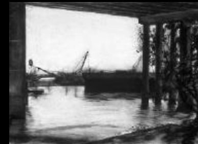
Untitled / 2001 / Charcoal / 22" x 30"

"In our time, it is no longer possible to experience landscape without a sense of loss and uncertainty. Nature is imperiled, precarious and finite. No aspect of our natural environment is unaffected by development, technology and modern industry.... Any reading of contemporary landscape painting must carry an implicit awareness of this predicament. Otherwise, we risk nostalgia, believing in a past that lives only in the romantic imagination."