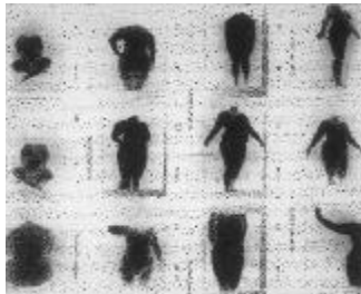
Lift / 1995 / Etching

Descriptions of Elizabeth Sandvig often include the words perseverance , passion , dedication , and generosity . Working most recently with sonograms derived from bird song, and with images and gestures of the female body, Sandvig continues to investigate and advance the print medium with agility. "I am stimulated by the struggle to make images and ideas come together by seeking the right combination of my hand and my mind in arriving at an energetic resolution, which is primarily visual, and secondarily pictorial," she says. For more than four decades, Sandvig has challenged herself artistically, in prints, paintings, mixed media and sculpture, and she