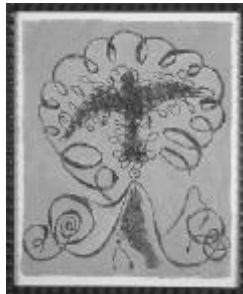
True Blue Birds / 2001 Clayprint ink gouache on paper

Deborah Mersky has developed a visually compelling personal vocabulary of images that emerge through the unique relief process of clay printing. "It is such a direct and simple process, a very responsive and soft relief technique, really, and it continues to occupy me. I find the clay surface to suit me perfectly. It can appear dry and textural, with a look of sturdy roughness that gives character to my work." Mersky's subjects, which include birds, insects, leaves and