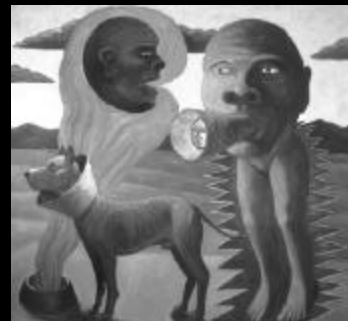
Dog with Spirits / 2002 / Oil on canvas

"For the past ten years, my artwork has addressed the spiritual alienation that exists within our consumer culture. This alienation is often unrecognized, since consumerism distracts us from questioning our place in the universe and in our communities. In my work, I attempt to combine the two seemingly antagonistic concepts of the Sacred and the Profane into new manifestations of American spirituality."