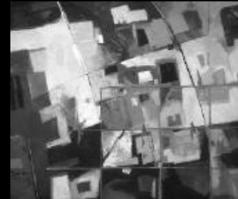
Subdivide / 2002 / Mixed media on panel